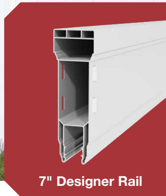
7" Designer Rail