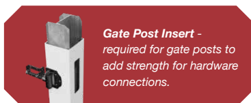
Gate Post Insert - required for gate posts to add strength for hardware connections.