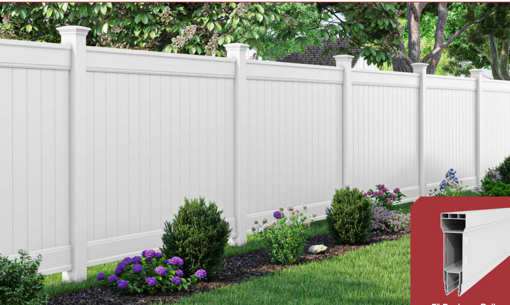
7" Designer Rail